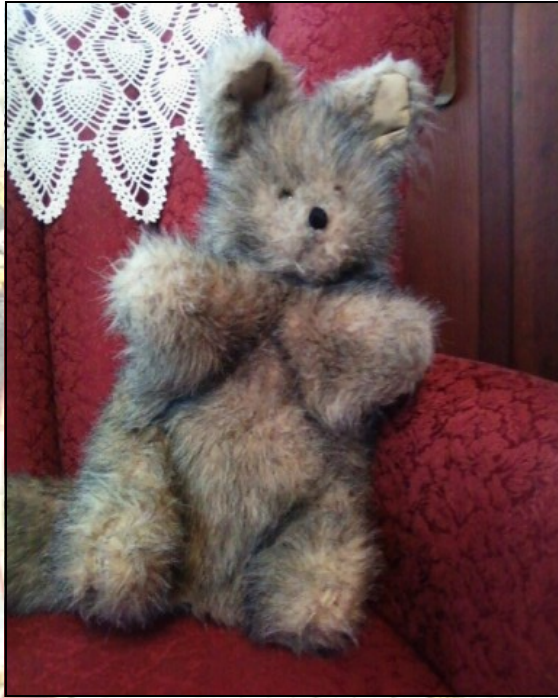
Henry the Museum Puppet helps introduce the day's topic—and gives hugs before you go home!

http://kenthistoricalmuseum.org/education/programs/little-explorers