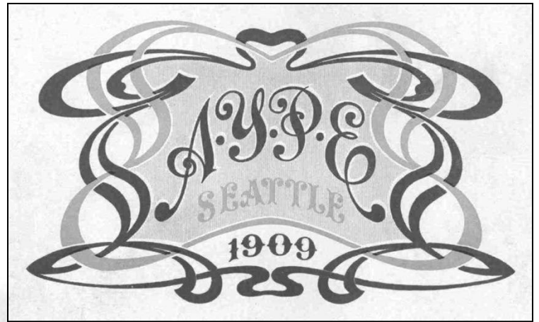
AYPE Souvenir Card, 1909

Opening Day, June 1, was declared a city holiday, and 80,000 people attended. Attendance was even higher—117,013—on "Seattle Day." Other big draws were days dedicated to various ethnic groups, fraternal organizations, and U.S. states. By the time the fair closed on October 16, over 3,700,000 had visited.