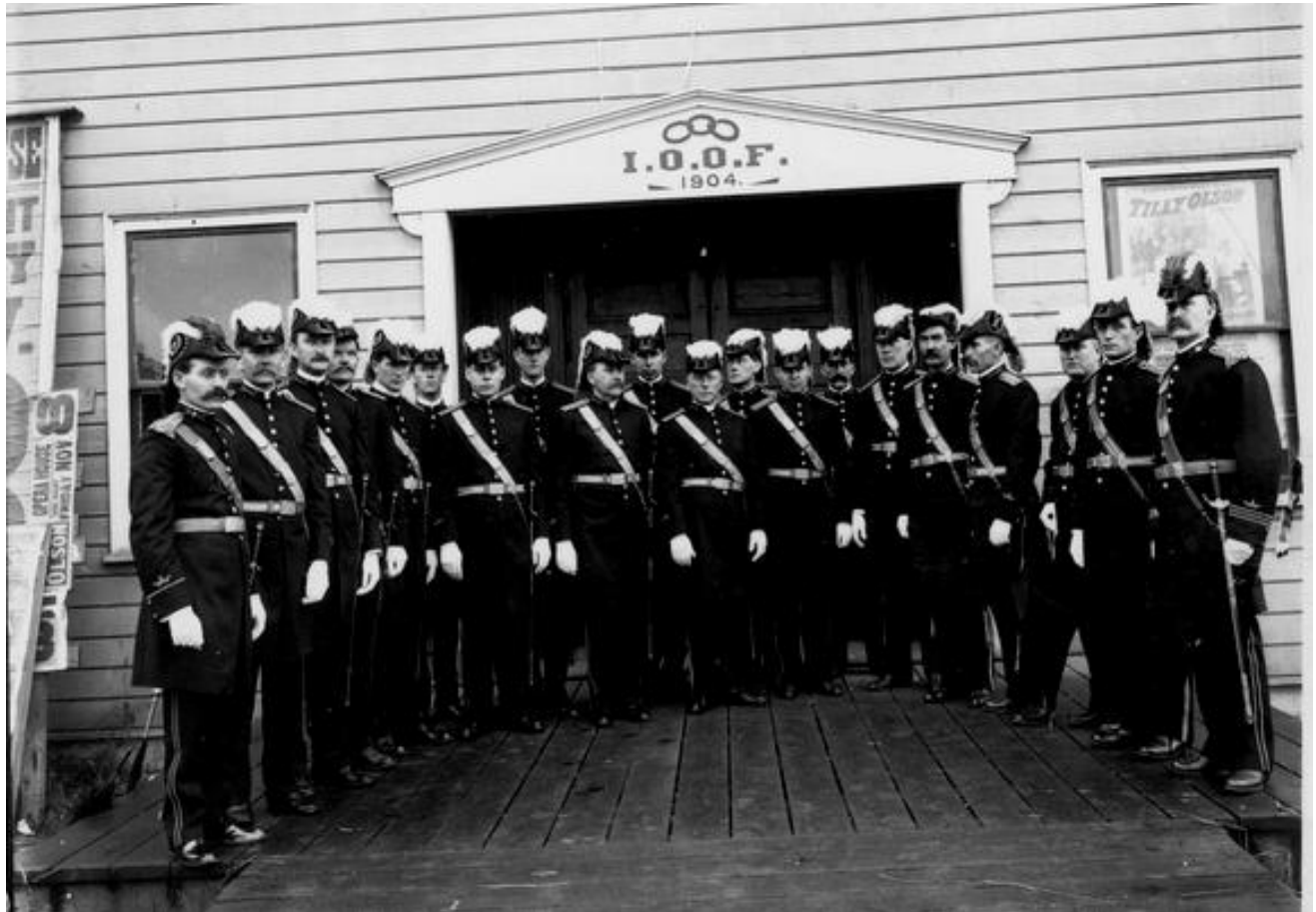
Kent Odd Fellows, 1900s

“The Titusville Lodge no. 34, Independent Order of Odd Fellows, was instituted April 2, 1885... making it older than either Kent or the State of Washington... They had no regular meeting place, until a hall was built on West Meeker Street in 1907... the Odd Fellows Lodge filled the community’s need for a meeting hall and an auditorium until it burned down in 1932.”