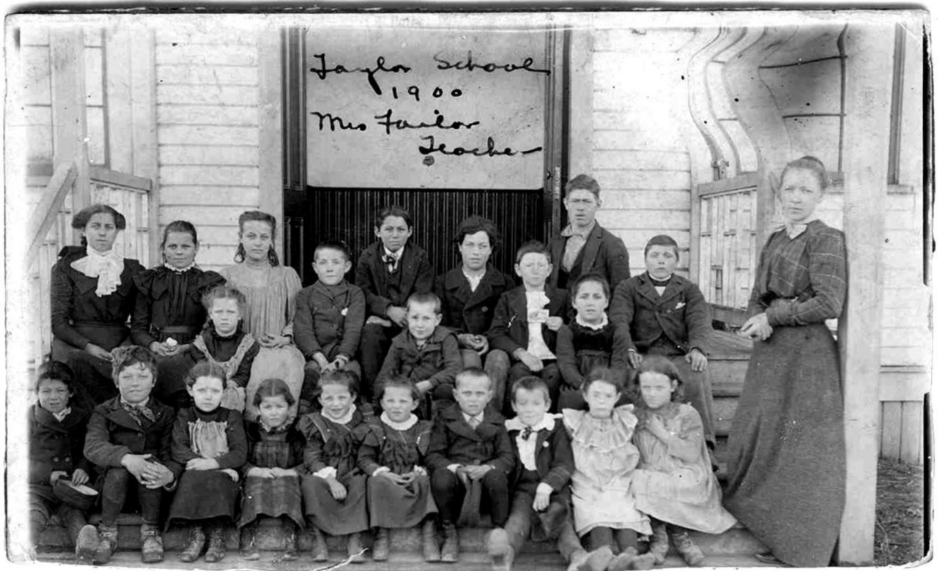
A class from the Taylor School, 1900

The Taylor School was located north of James Street, on the corner of what is now 228 th Street and 64 th Avenue. The school was open from 1892 to 1904. On the following page is a newspaper article from 1963, written by a man who remembered the school.