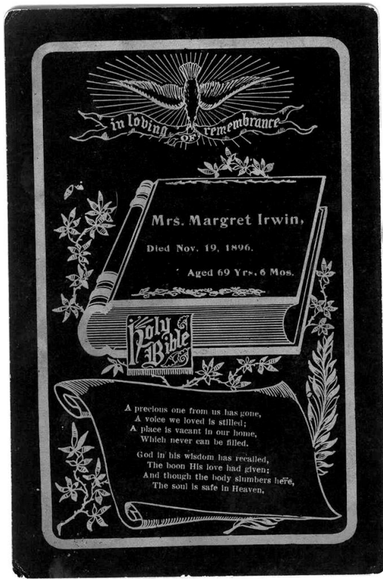
An 1896 memorial card from the Museum's collection

At first it may seem a macabre collectible. But the memorial card, evidence and reminder of a death, is a fascinating record of history and manners. These cards are still in use, but those of the Victorian era are of particular interest. Full of symbolism and sentiment, they reveal the character of an age.