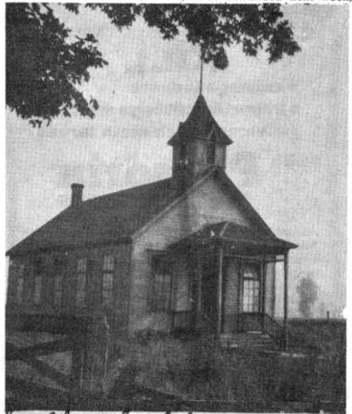
The old school house, the old maple tree in foreground